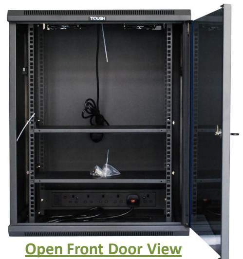
Open Front Door View