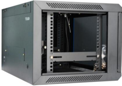
Open Side Door View